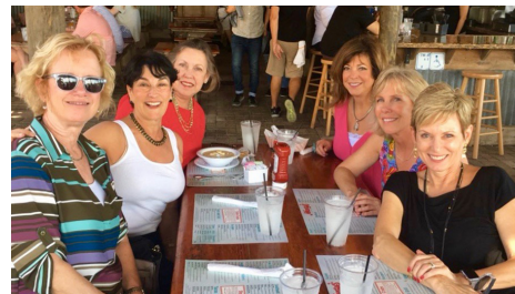
Miami School of Law