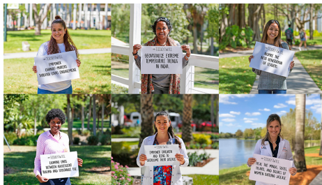
International Women's Day