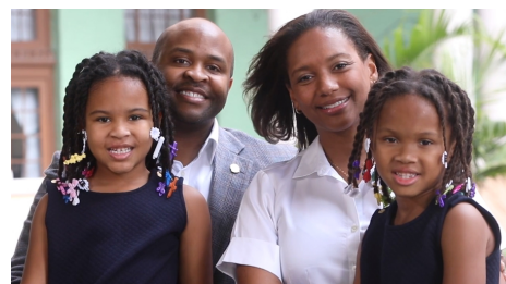
Meet the Donalds