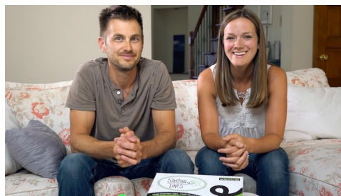
FEATURED 'CANE BIZ

@nj_canes Woman 'Cane Wednesday! Also shout out to The U for being the