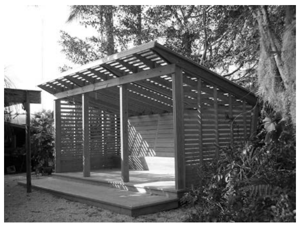
Figure 3: Finished Orchid Sales-display pavilion.

(because it was hot) and put the pulp side down between the wood skids and joists that support the 1700 lb. module. To everyone's amazement, the leftover pulp and fleshy consistency of the skin, stayed together long enough to slide the heavy modules along the skids with very little effort. This tool/technique, underscored the value of ingenuity and resourcefulness for solving a problem on the spot. With the addition of a cable winch hoist, car jack and steel bars, students lowered the modules onto the trailer and ultimately transported all three modules to the site.<sup>2</sup> Today the finished building is well liked and has become the front porch to the nursery.