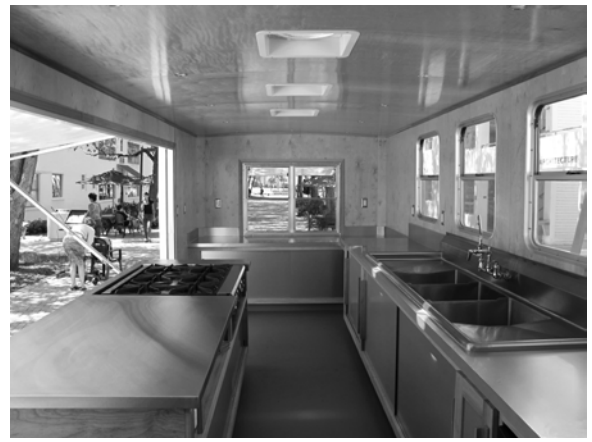
Figure 4: Interior of mobile organic kitchen.

semesters end we had completed the frame, floor, windows and doors and some of the exterior metal skin. Time spent figuring out how to remove the reverse camber in the chassis, build the drop down doors, weld the frame and coordinate all the systems made the project drag on leaving most of the interior to be built after the semester was over. While the final cost of $18,000 was perhaps 4 times less than if the owner built this from scratch, the additional hours put into the project made this a long and difficult project that required volunteer hours and a varied work crew to finish the project.