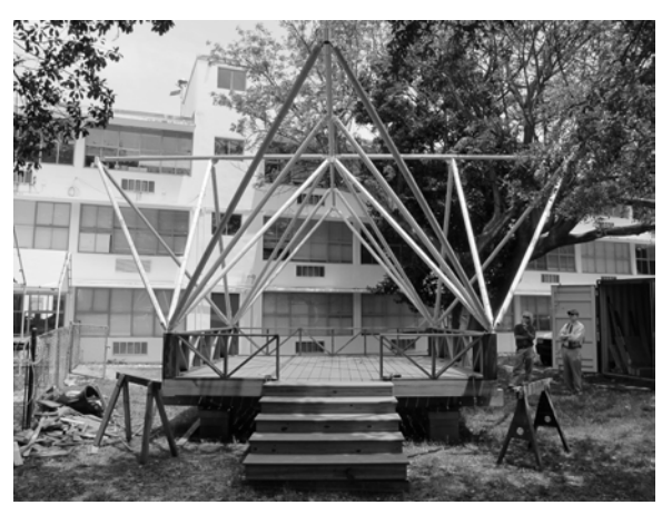
Figure 7: Framing and platform for Eco-tent with the canvas removed.

The green materials for the project include bamboo and plastic composite decking (Cali bamboo), that is low maintenance and rot heat-treated pine, glulam spruce resistant, poles, aluminum fittings, stainless steel fasteners; straps, angle braces and saddles. The stainless steel fasteners were donated by Simpson Strong-tie who in return for their contribution will monitor the fasteners performance. The largest components of the project are the deck platforms that measure