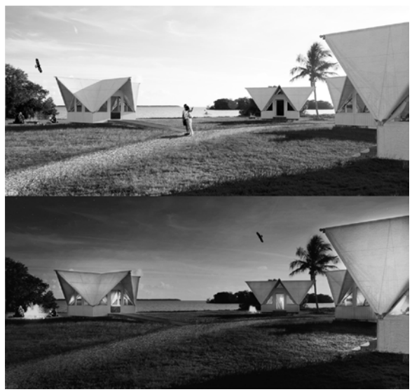
Figure 8: Eco-tents by day (top), and night (bottom).

6. The semester long project definitely pushes the aesthetic/value questions of hand-made versus off-the-shelf. One often simultaneously hears the whispers of Ruskin in one ear and Neutra in the other. These two conflicting positions (hand- made pieces versus selecting mass produced components) are often difficult to reconcile. Experience shows that when at all possible listen to Ruskin - production may slow down but students get so much more from the experience. In an increasingly disengaged world, facilitated by technology, Design/Build is invaluable in re-sensitizing students to a tactile process, each other, the public, the discipline, and most importantly their own hands.