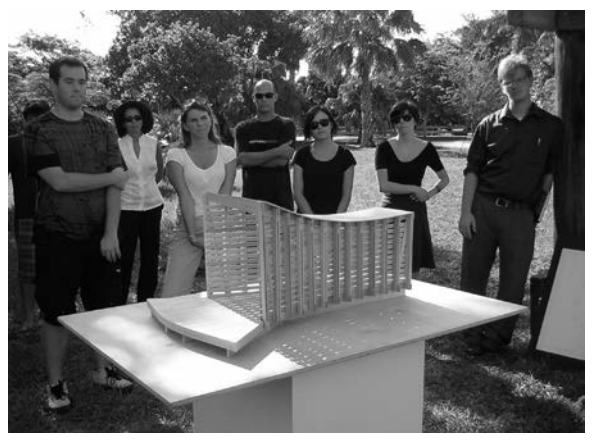
Figure 1: Tired students say goodbye to an innovative design for Crandon Park.

Project 1, was to create a modest shade structure for Crandon Park, a Miami/Dade County post-war park built in 1947 on Key Biscayne. This simple project evolved into a complex political tug of war that would eventually require the class to design a second project, on a new site, with an entirely different client and program.