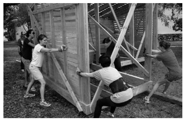
Figure 2: Students using oranges to move a module for transport.

Villaraos, a Cuban exile who has an encyclopedic knowledge and facility for making just about anything, often frames lessons in building with a story about Cuba. He said: "When living in Cuba one quickly learns to make-do with what one has on hand," adding "when we needed to move something really heavy and we had no equipment to do the job - we used oranges." So after listening to what sounded like "tall tales" students cut a dozen or so oranges, ate the interior of the oranges