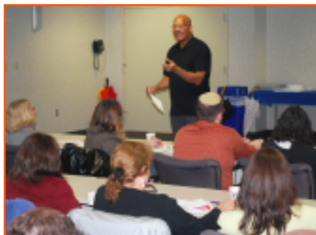
(Top) Participants analyze currency in the "International Currency Exchange."