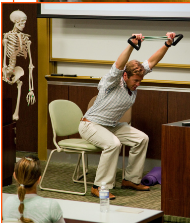
(Top) Participants in the Colloquium practice movements to aid healing.