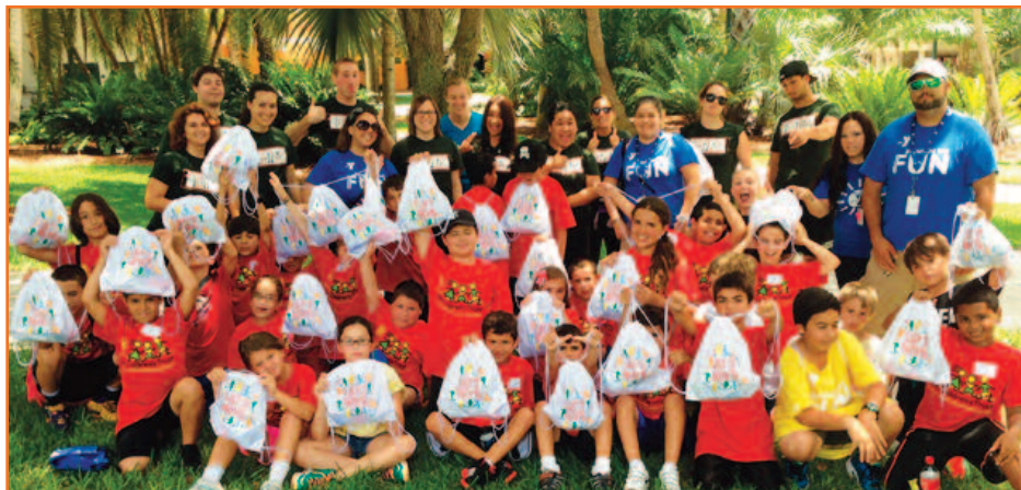
THINK Program participants on the UM campus.