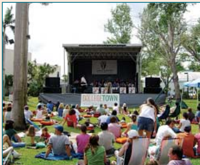
The Frost Concert Jazz Band was the featured group on a series of concerts "On the Green."