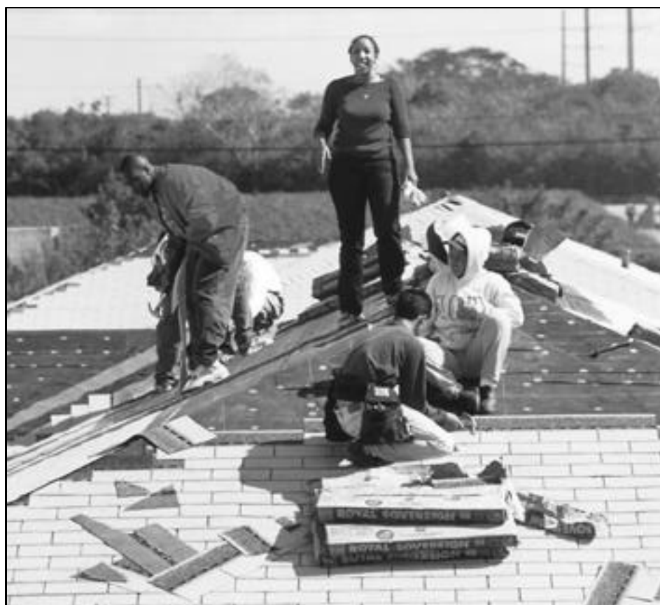
UM Law students and staff help renovate a home for Habitat for the Humanities, a H.O.P.E. outreach project.