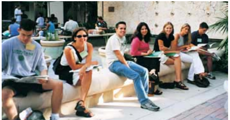
Members of the Class of 2004 take a break during last fall's orientation.

The Class of 2004 includes former congressional aides and interns, White House interns, holders of prestigious military medals, members of countless dean's and president's lists, members of honor societies, and one Miss USA International pageant winner.