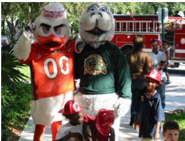
(Bottom Left Photo) The annual Canes Carnival, sponsored by H.O.P.E., was held on September 19 and brought children from after-school shelters to the Law School campus for a day of fun.