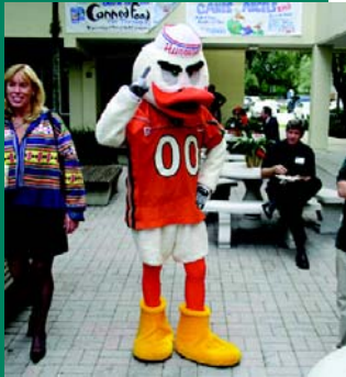
See page 12