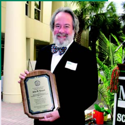
See page 16