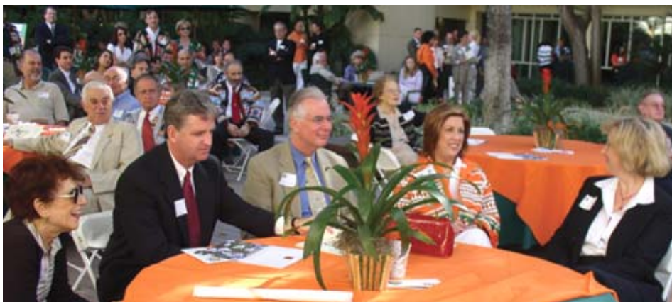
Homecoming Breakfast and Morning Spirits in the Law School Quadrangle on November 15.