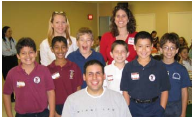
(Bottom Right Photo) H.O.P.E. volunteers with elementary students who took part in a four-week Books and Buddies program sponsored by H.O.P.E.