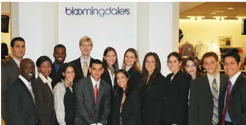
(Left Photo) H.O.P.E. volunteers at a fashion show sponsored by Bloomingdale's, which donated a percentage of the profits to H.O.P.E.

H.O.P.E.'s Volunteer Income Tax Assistance (VITA) program, nationally recognized in 2002 as the Outstanding Student Project in the country by Equal Justice Works and Rookie Site of the Year by the American Bar Association, is continuing to provide free tax preparation assistance in English, Spanish, and Creole to low-income, disabled and elderly individuals. This year H.O.P.E. plans to extend its services by bringing a VITA site on campus as well as to various elementary schools to assist our neighboring communities.