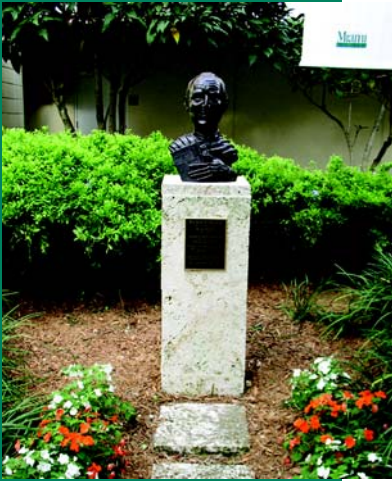
See page 8