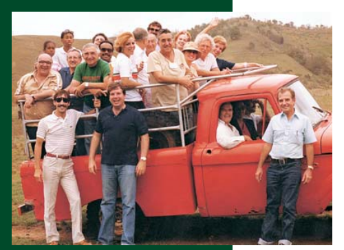
See page 3